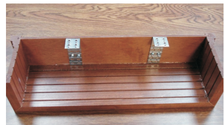
Cornice showing outside mount brackets installed