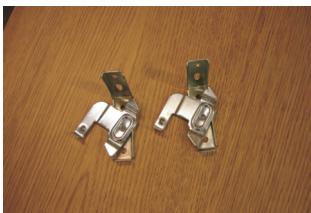
2" Blind Overhead Brackets

When installing blinds or shades with Veneto Cornices, the brackets normally included with the product will be used in installation with the exception of 2" and 2 1/2" Horizontal Blinds. Special overhead swivel lock brackets will come the Cornice package to substitute for standard box brackets.